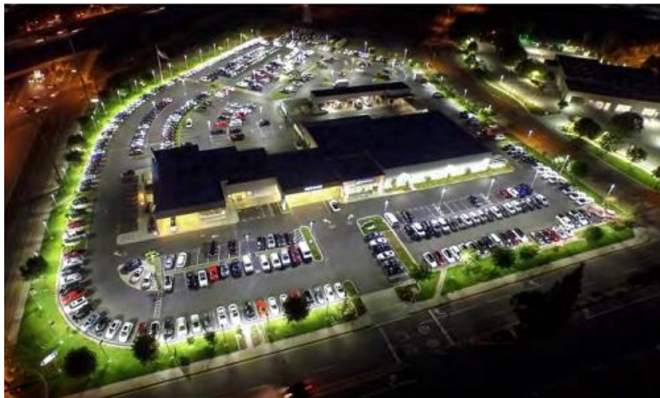
Car dealership in California using the VLX fixture

and include die casting, sand casting, metal spinning and fabrication as well as a state of the art powder coat paint facility. A new LED lab and SMT assembly area assure quality and timely production of all of our LED products. Their design and applications department utilizes cutting edge technology to provide our customers with the best complete engineering assistance when required.